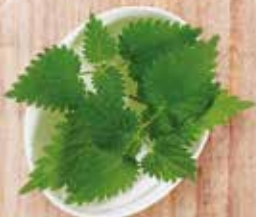
stinging nettle leaves